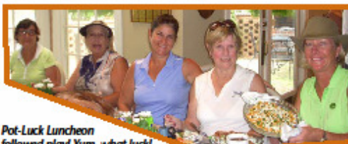
Pot-Luck Luncheon followed play! Yum, what luck!