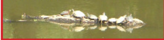
Spotted Tuesday, June 22 in the pond next to #5!! The Wildwood Monster! Actually a log with sun-bathing turtles!