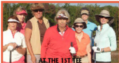
AT THE 1ST TEE