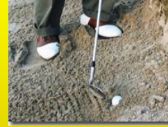
Plugged Bunker Shot

Understand: Because the ball is in a hole, it will come out fairly low and with very little spin. Little spin will cause the ball to roll when it lands on the green.