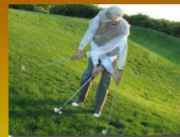
Downhill Chip Shot

Keys: Flip your seven iron around, stand very close to the ball with your back to your target. You are going to use your dominant hand to hit the shot. Take lots of practice swings, and avoid your ankle! Trust me, this is much easier than trying to hit it left-handed.